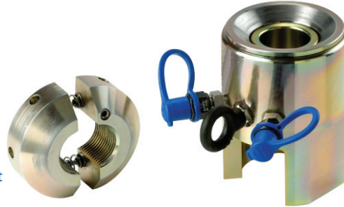
Split Reaction Nut

Torq/Lite® standard sub sea tool range incorporates a combined body and bridge, lifting eye bolt, 30 mm piston stroke, 1500 bar operating pressure, twin hydraulic connections, a maximum piston stroke indicator and a split reaction nut. Lower cost solid reaction nuts are also available. These tools are fitted with composite material high pressure seals which clip into place and require no adjustment.